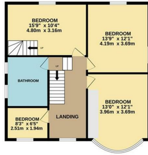
FIRST FLOOR 761 sq.ft. (70.7 sq.m.) approx.