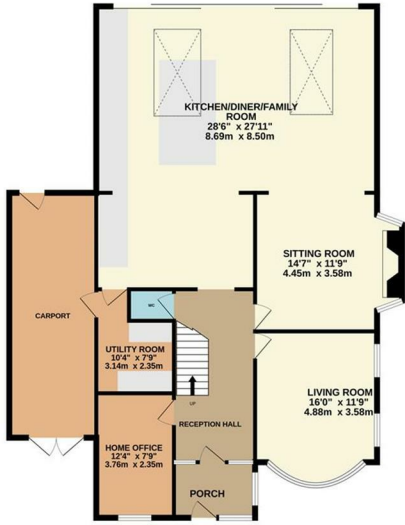
GROUND FLOOR 1562 sq.ft. (147.0 sq.m.) approx.